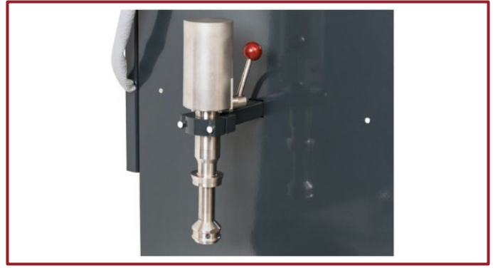
Figure 3: Re-engineered SAM with improved Thermocouple Pair Holder