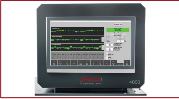
Figure 2: Large graphical OCM display for user-friendly operator interaction