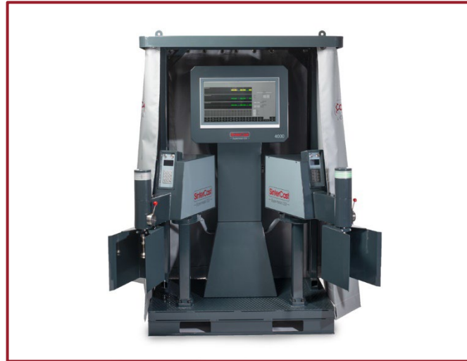
Figure 1: Fully Automated System 4000 with two Sampling Modules

The fully automated System 4000 provides a flexible, robust and accurate hardware and software platform that enables SinterCast customers to independently control CGI series production and product development. The System 4000 is comprised of individual hardware modules that can be configured to suit the layout, process flow and production volume of any foundry, both for ladle production and pouring furnaces. The basic configuration consists of one Sampling Module (SAM), one Operator Control Module (OCM), a Power Supply, and a network-linked Wirefeeder for automated addition of magnesium and inoculant prior to casting. This configuration provides sampling capacity for approximately 15 ladles per hour. Additional Sampling Modules can be added to increase the throughput. The System 4000 Plus upgrade additionally incorporates automatic feedback control of the base treatment process.