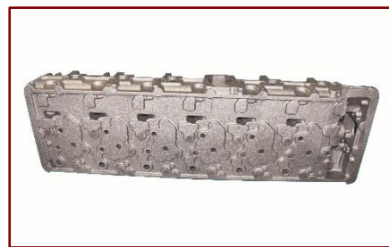
The new JMC cargo truck 9.0 litre SinterCast-CGI cylinder block 13.0 litre SinterCast-CGI cylinder head

[Stockholm and Shanghai, 19 April 2017] – JMC Heavy Duty Vehicle Co., Ltd, a division of Jiangling Motors Corporation, Ltd, has today unveiled a new heavy duty commercial vehicle for the domestic Chinese market at the 2017 Shanghai International Automobile Exhibition. With 9.0 litre and 13.0 litre engine options, the new truck is the result of the JMC-Ford joint venture in China, leveraging Ford’s European vehicle and engine technology with JMC’s local manufacturing base and distribution network. Produced using the SinterCast process control technology at the ASIMCO International Casting Co., Ltd foundry in Shanxi, China, the 9.0 litre engine specifies CGI for both the cylinder block and head while the 13.0L engine specifies CGI for the cylinder head. The new engines provide state-of-the-art performance, durability and fuel economy in the world’s largest commercial vehicle market, while complying with Chinese CN5 emission regulations. With the start of vehicle sales at the Shanghai auto show, series production will begin shortly.